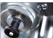
504.003 Additional type holder for UP 10 Ecoline. Simple change between different markings. 25 types.