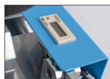
508.7001 Counter for UP 15