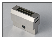
508.1002.3 (26 types, 13 each row)