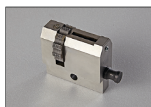
508.1003.3 (10 types in one row) 508.1001.3 (17 types distributed on 2 rows)