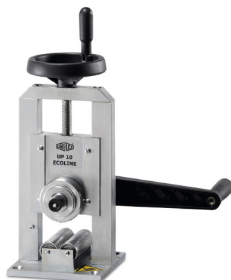
UP 10 Ecoline