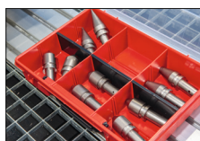
Sealing tips for hand clamping.