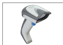
Barcode Scanner BCR CTR2C-Kit