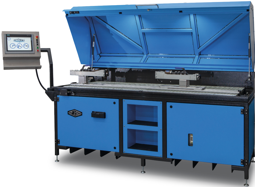
P 250 with one hand clamping

The P 250 / P 260 Test Bench with Control IPC are new modular test benches that can be adapted to your needs. They offer the possibility to test with the Steck-o, Hand or Hydraulic quick cone system. You can also install a Euro Pallet inside for the P 250 / P 260. The Chamber also accepts a non-end extension if you prefer to test a hose lengthwise (only P 250). The controller offers all parameters for a fully automatic test, with visualization of the pressure and may other features but also connectivity to your server or other machine in line with industry 4.0. or IoT.