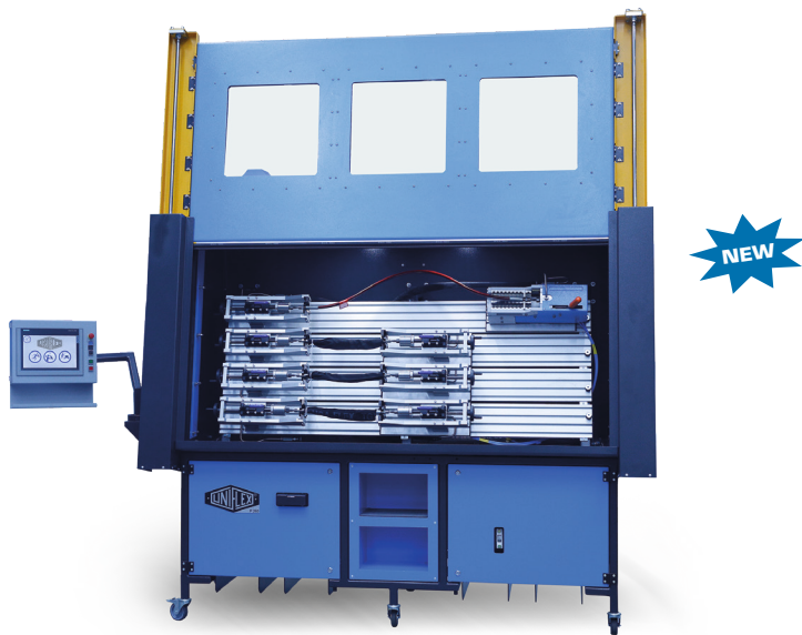
P 260 with four hand clampings