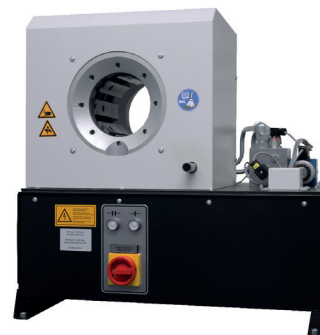
UG 32 S